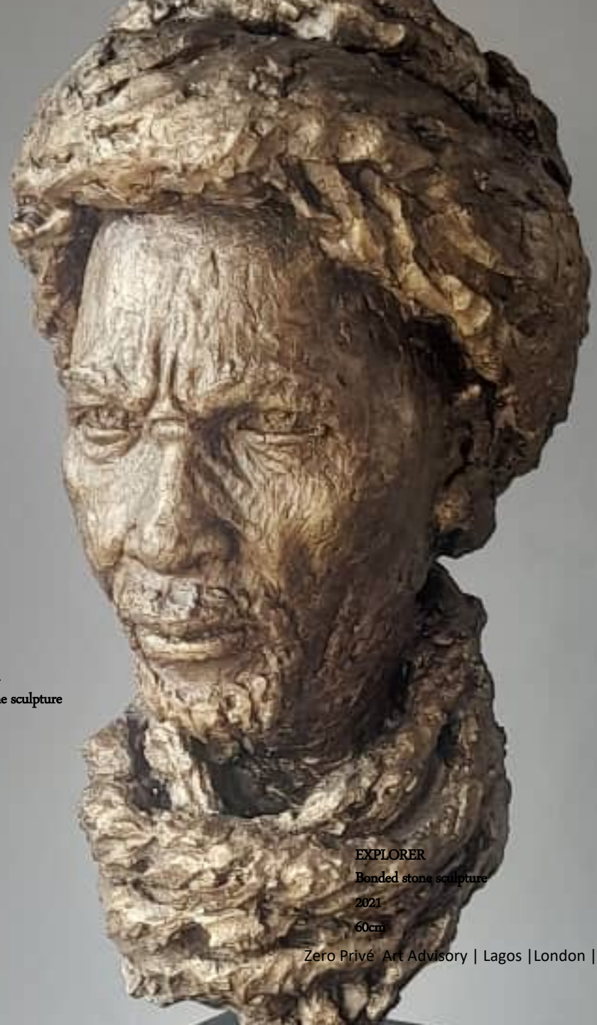
EXPLORER Bonded stone sculpture 2021 60cm