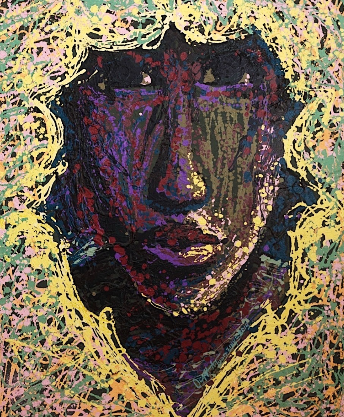
CAUTIOUS PEEP Acrylic on canvas 2016 3.5 x 5ft