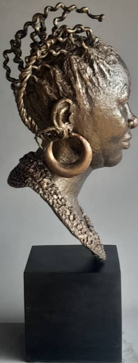
NGOZI Bronze 2013 69cm

Zero Privé Art Advisory | Lagos | London | Geneva