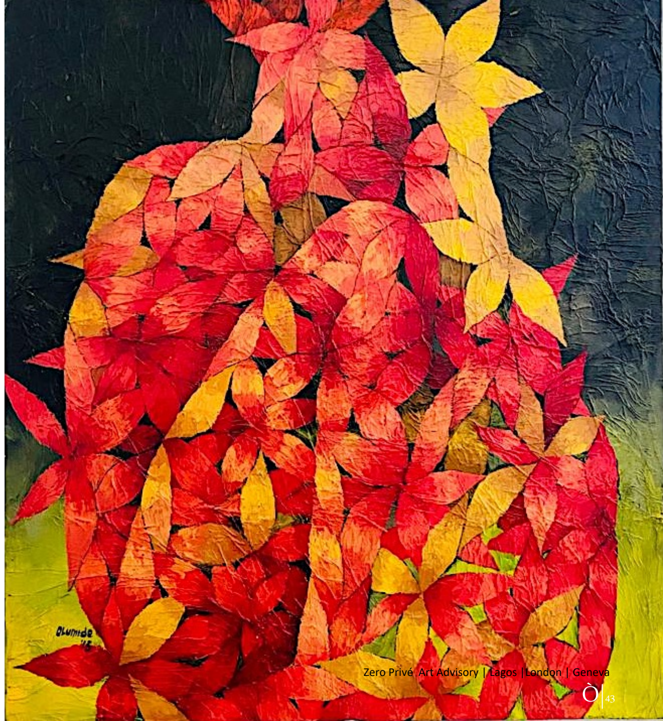
THE THINKER Acrylic on canvas 2015 3 x 4ft