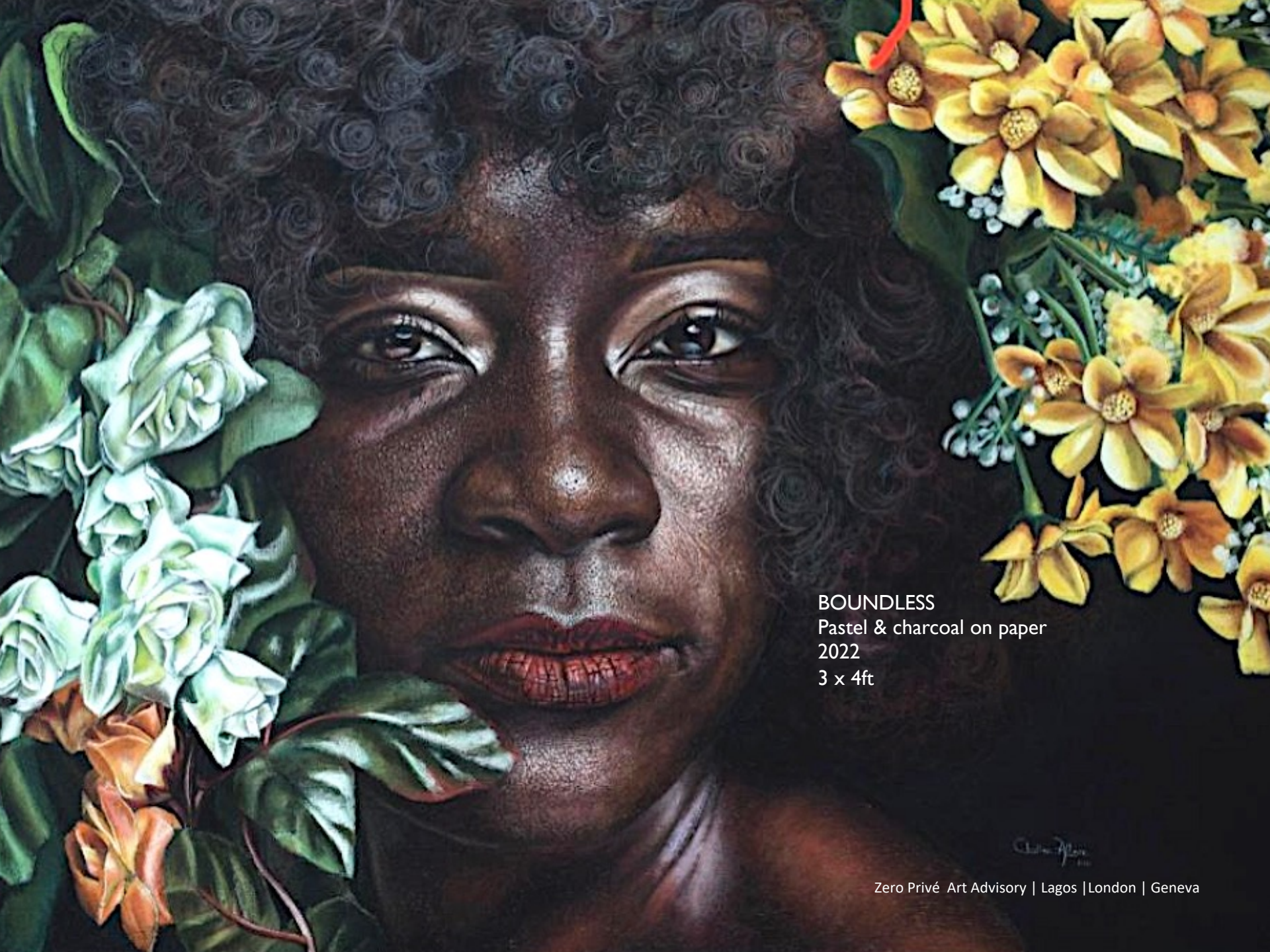
BOUNDLESS Pastel & charcoal on paper 2022 3 x 4ft