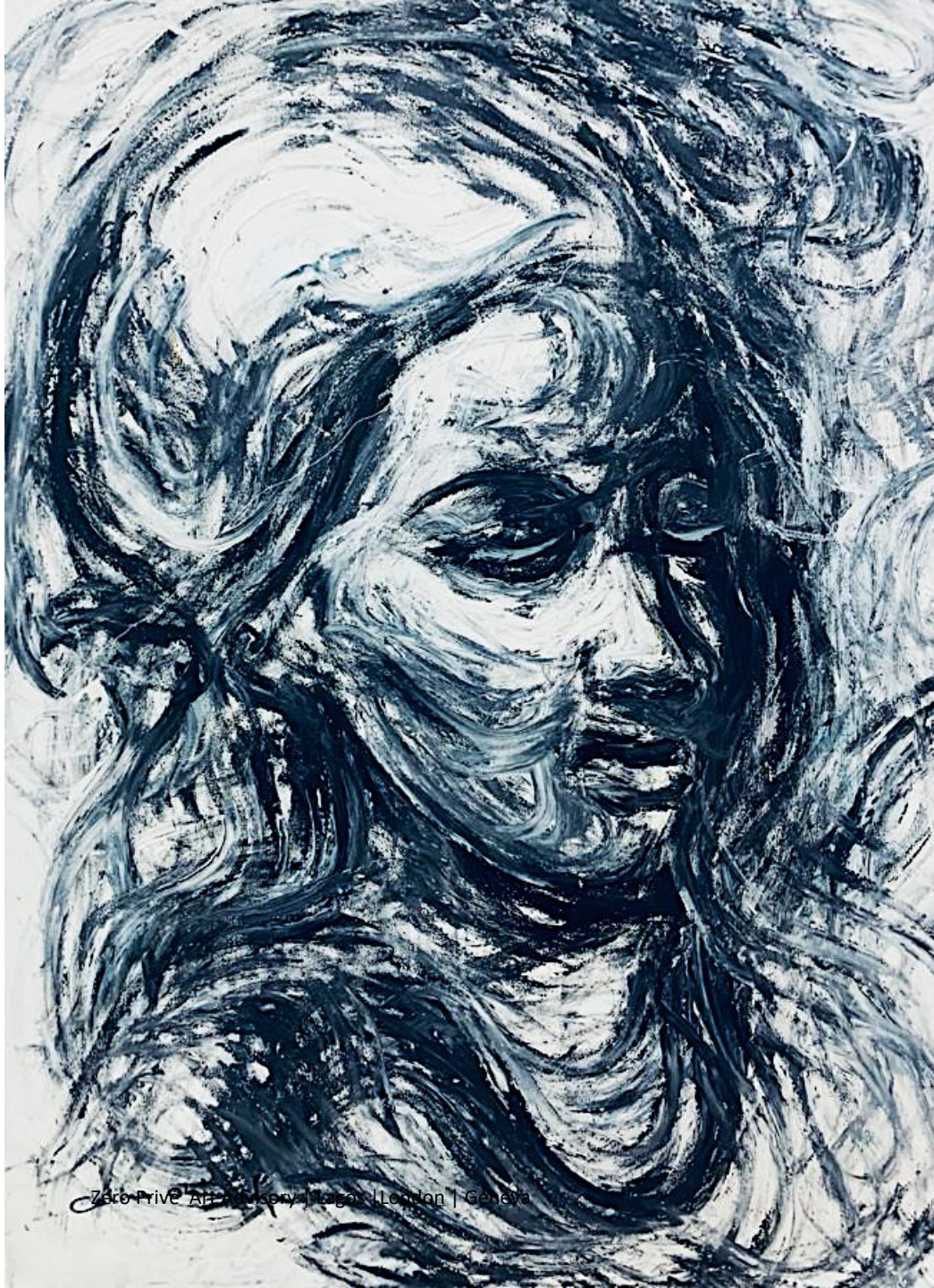
AFRICAN LADY Acrylic on canvas 2019 3 X 4ft