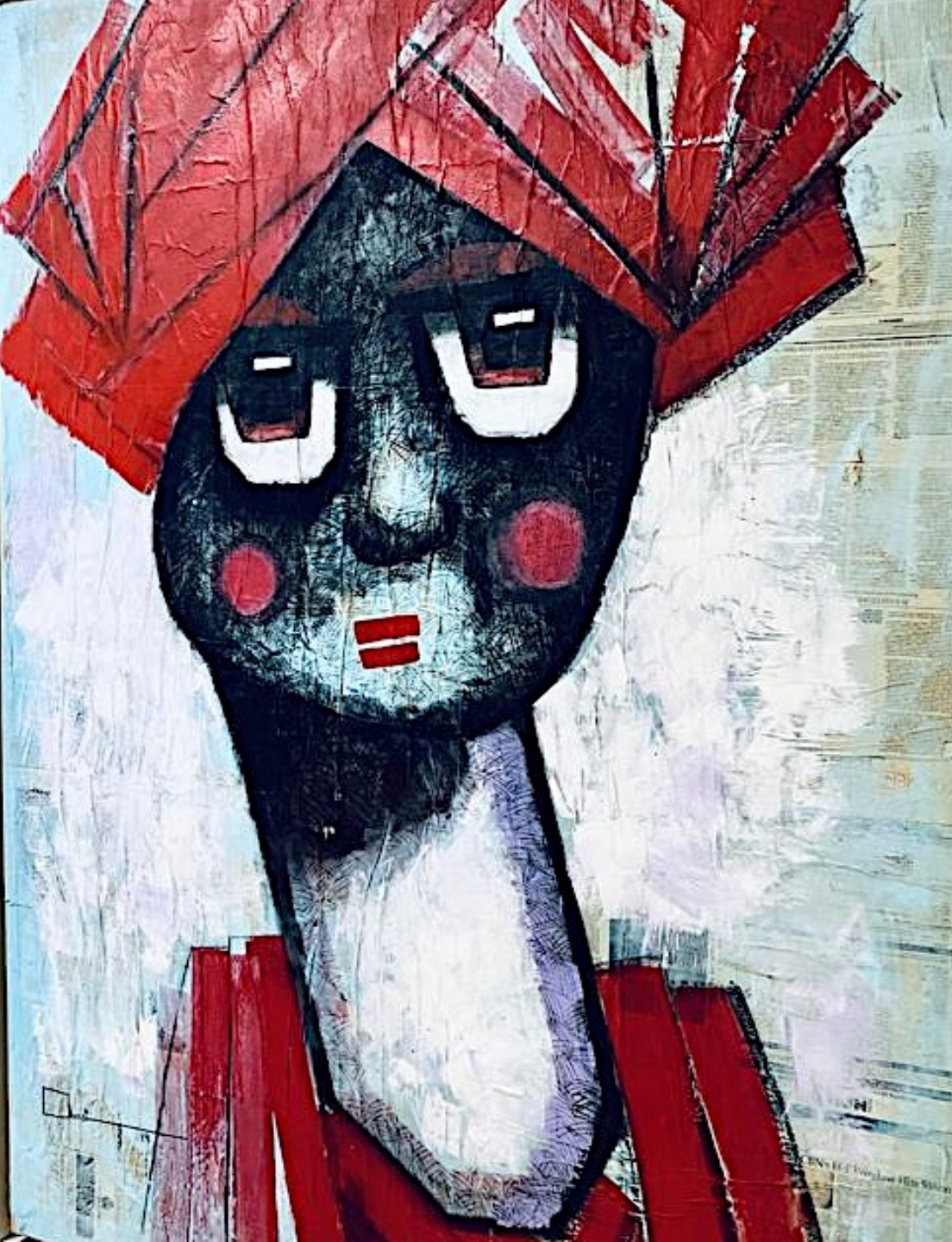
ELEGANCE Acrylic on canvas 2018 4 x 6ft