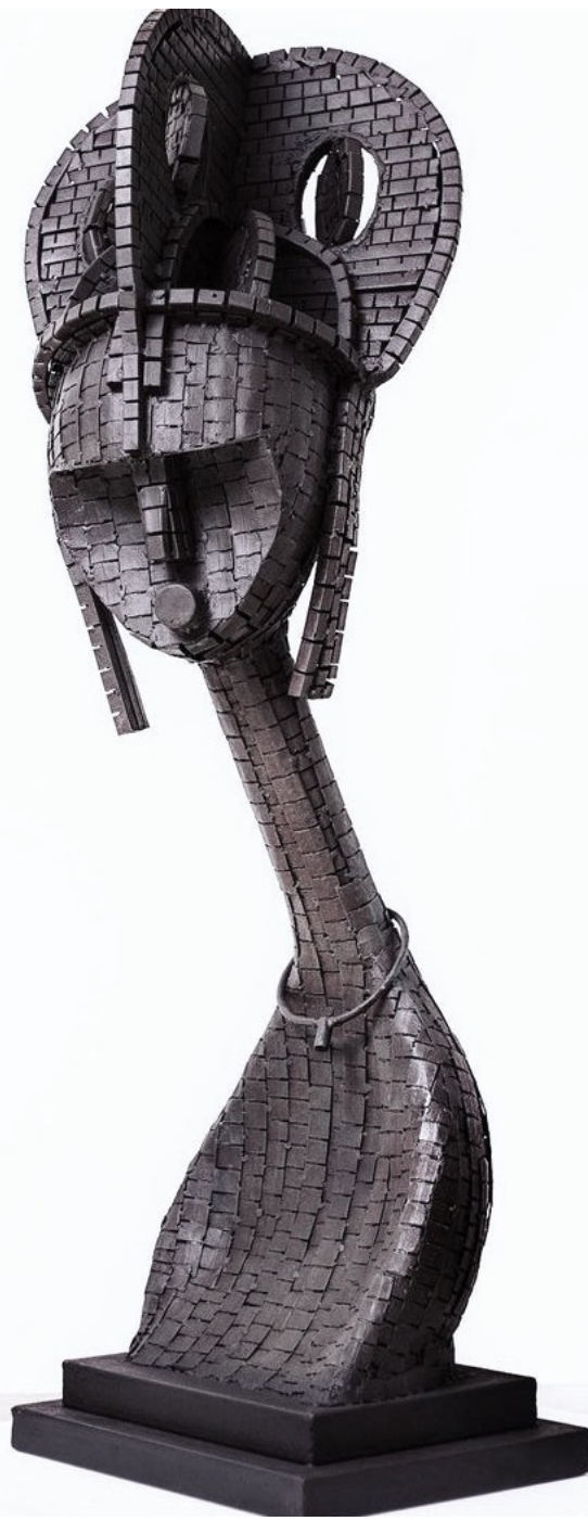
ROYAL MATRIARCH Metal sculpture 2020 4ft