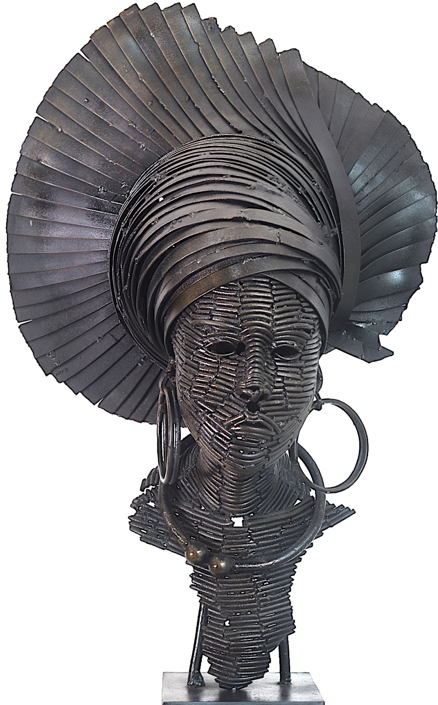
GELE DUN Metal sculpture 2016 2.5ft