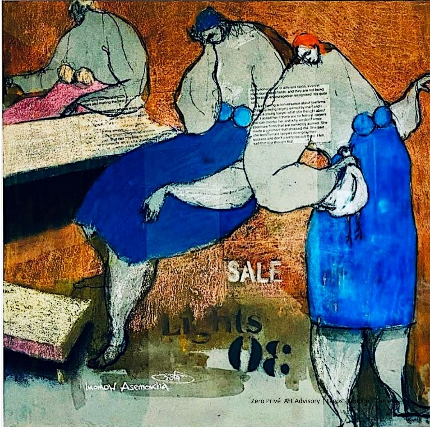
THE COCK THIEF Pastel on paper 2019 1.5 x 1.5ft