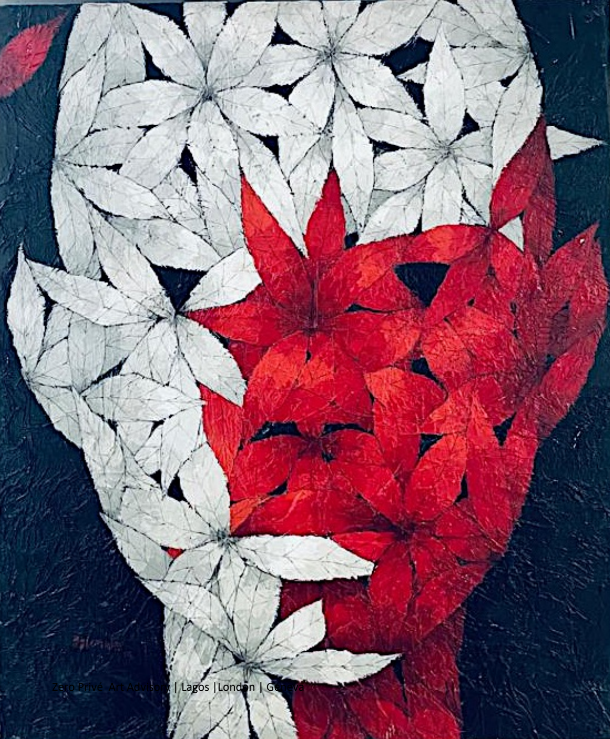
PORTRAIT OF A YOUNG BOY Acrylic on canvas 2019 2.5 x 3ft