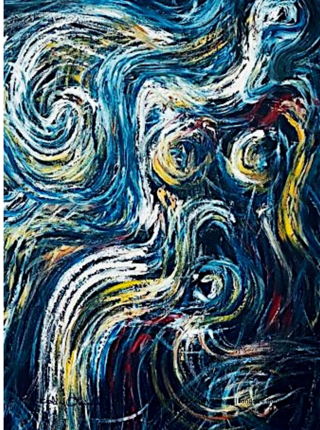
NUDE Acrylic on canvas 2019 3 X 4ft