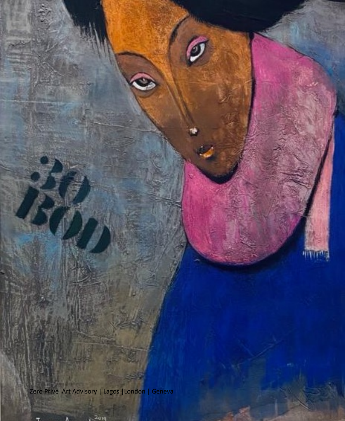
LADY IN PINK SHAWL Pastel & oil on paper 2019 4 x 4ft