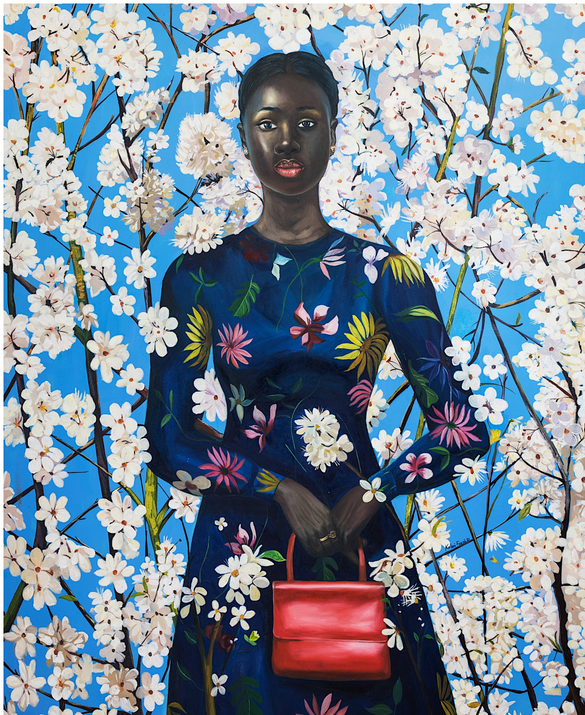
LOVE AND NATURE Acrylic & oil on canvas 2021 5 x 7ft