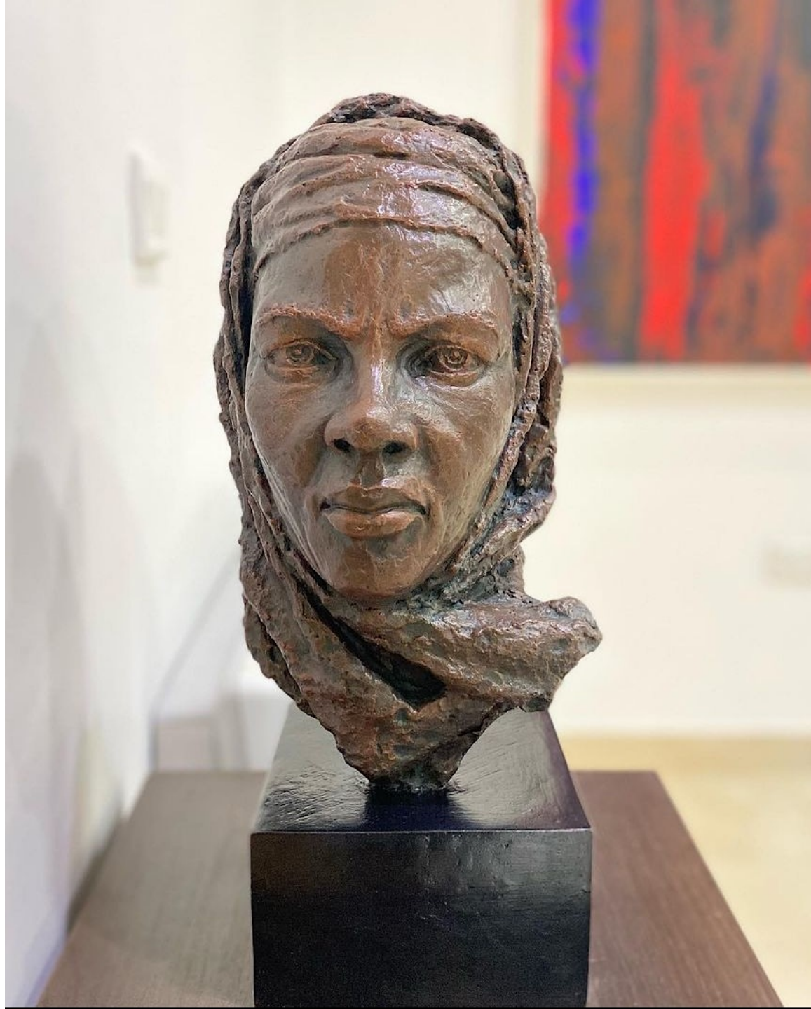
UNGOZOMA (MID-WIFE) Bonded stone sculpture 2012 2ft