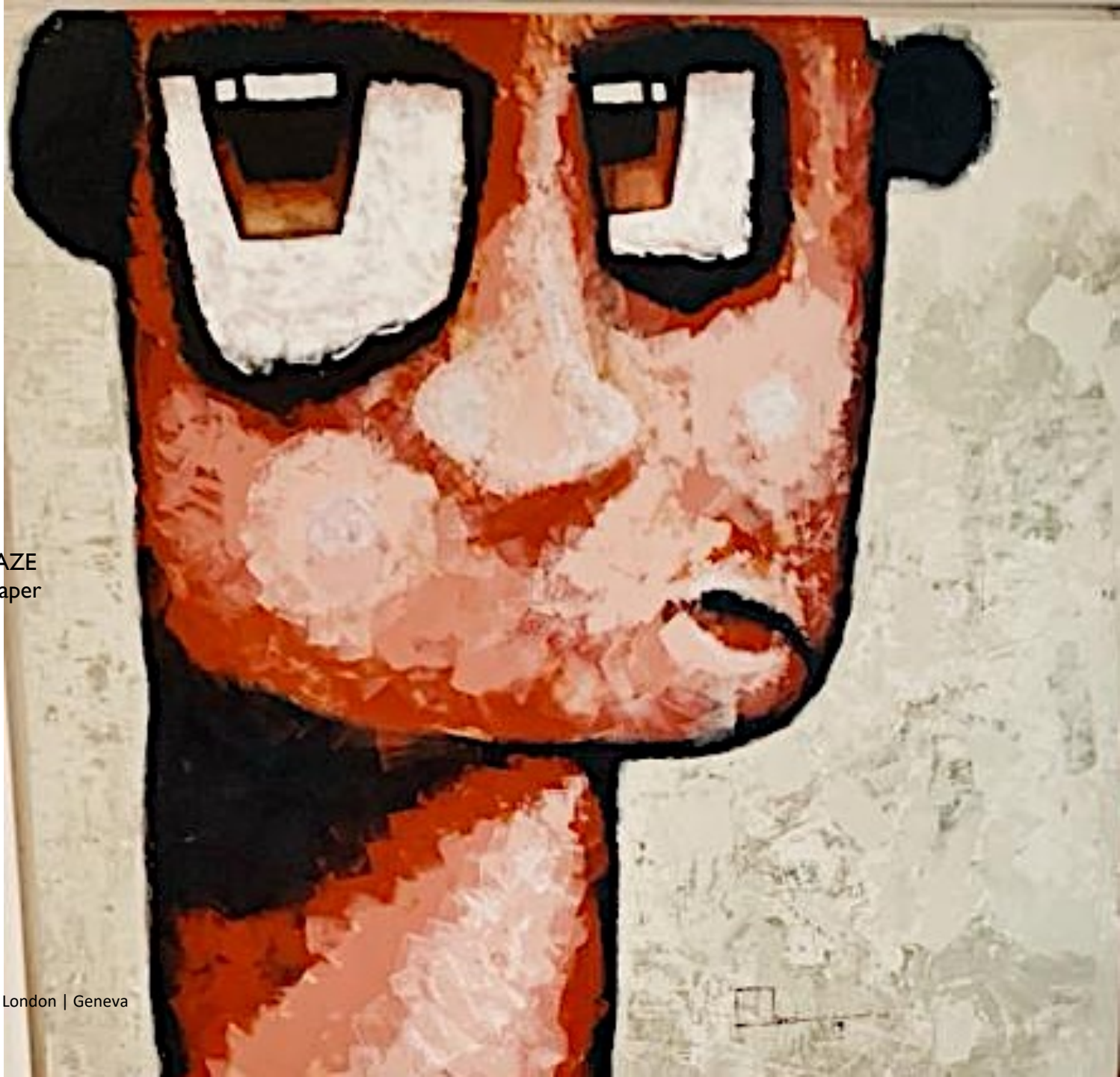
HOEFUL GAZE Acrylic on paper 2019 4 x 4ft