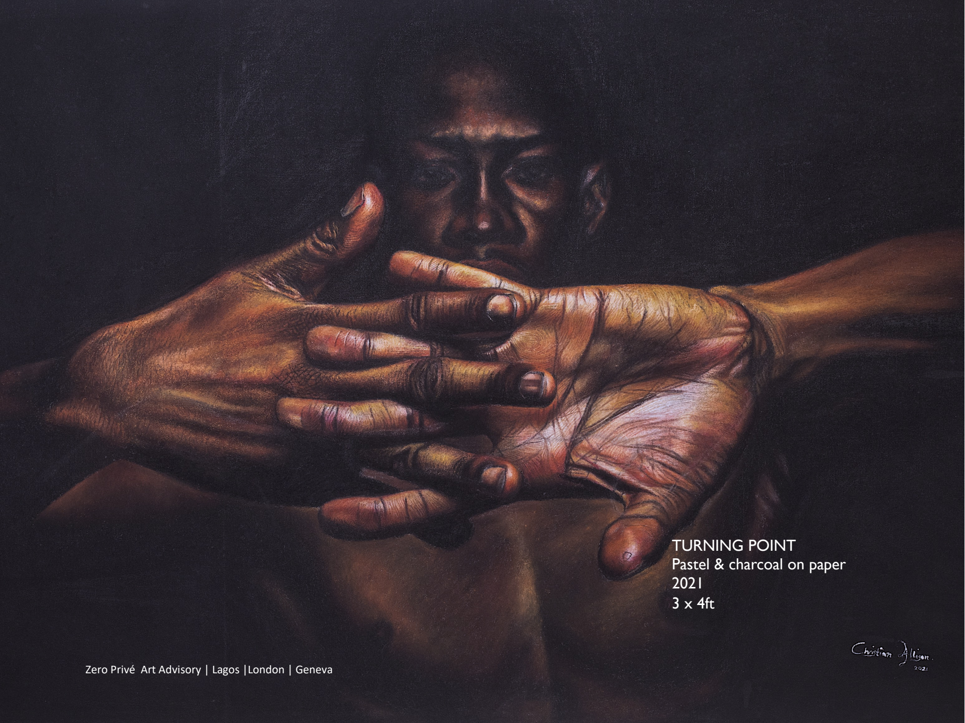
TURNING POINT Pastel & charcoal on paper 2021 3 x 4ft