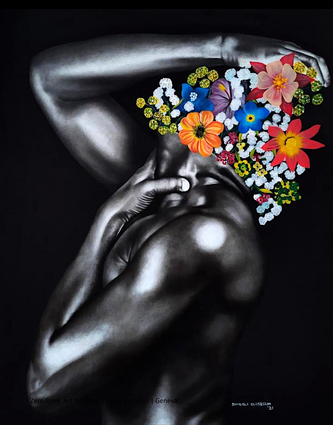
DÉJÀ VU 2 Charcoal & acrylic on canvas 2021 5 x 6ft