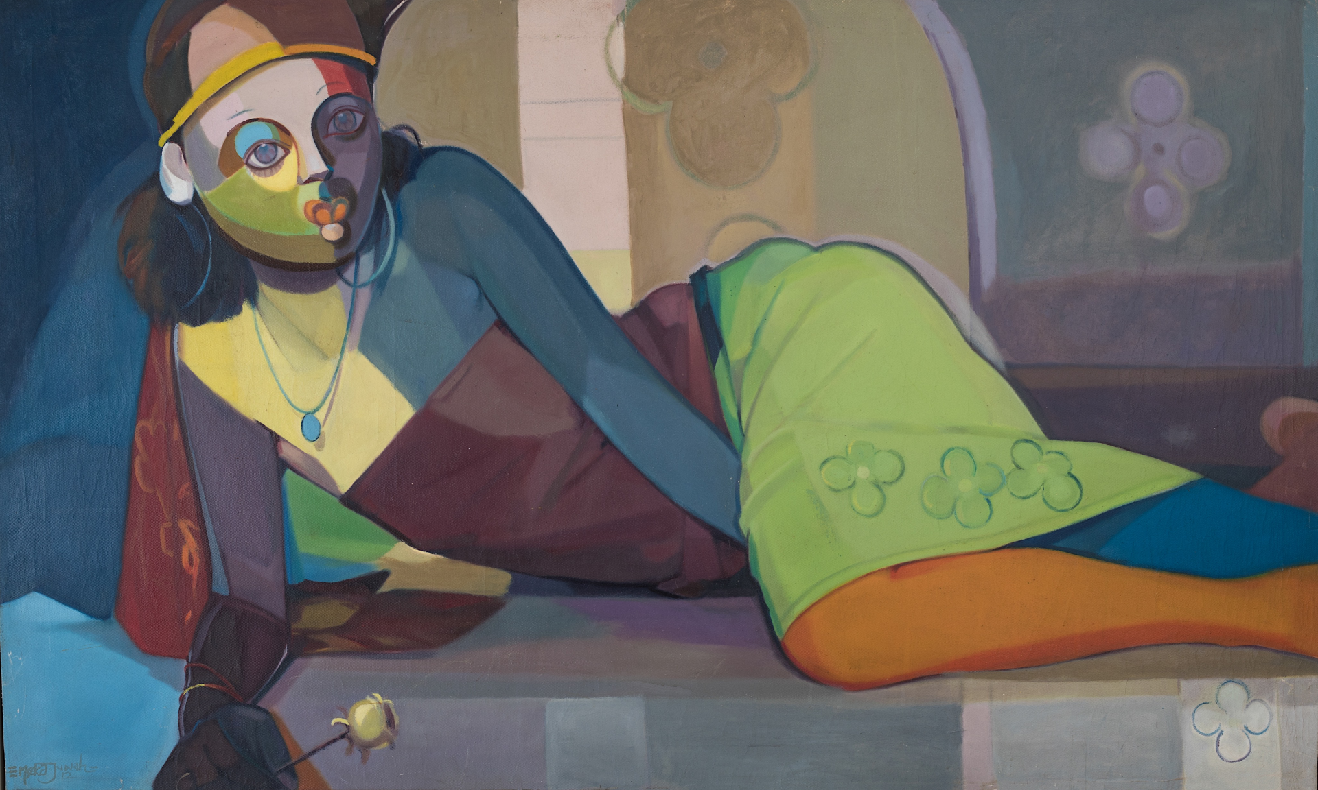
LADY'S DESIRE Acrylic on canvas 2012 2 x 3ft