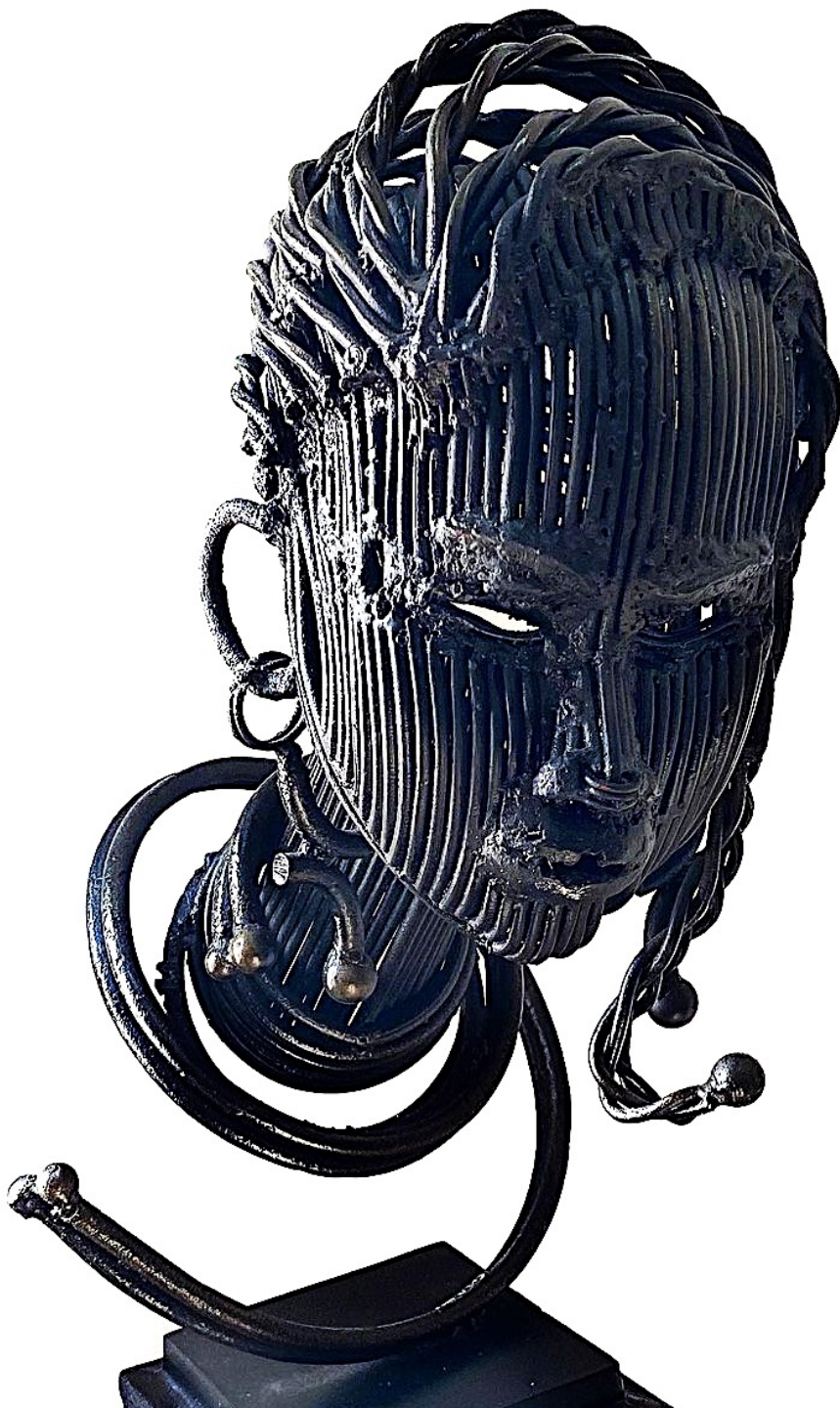
YORUBA PRINCESS Metal sculpture 2016 2ft