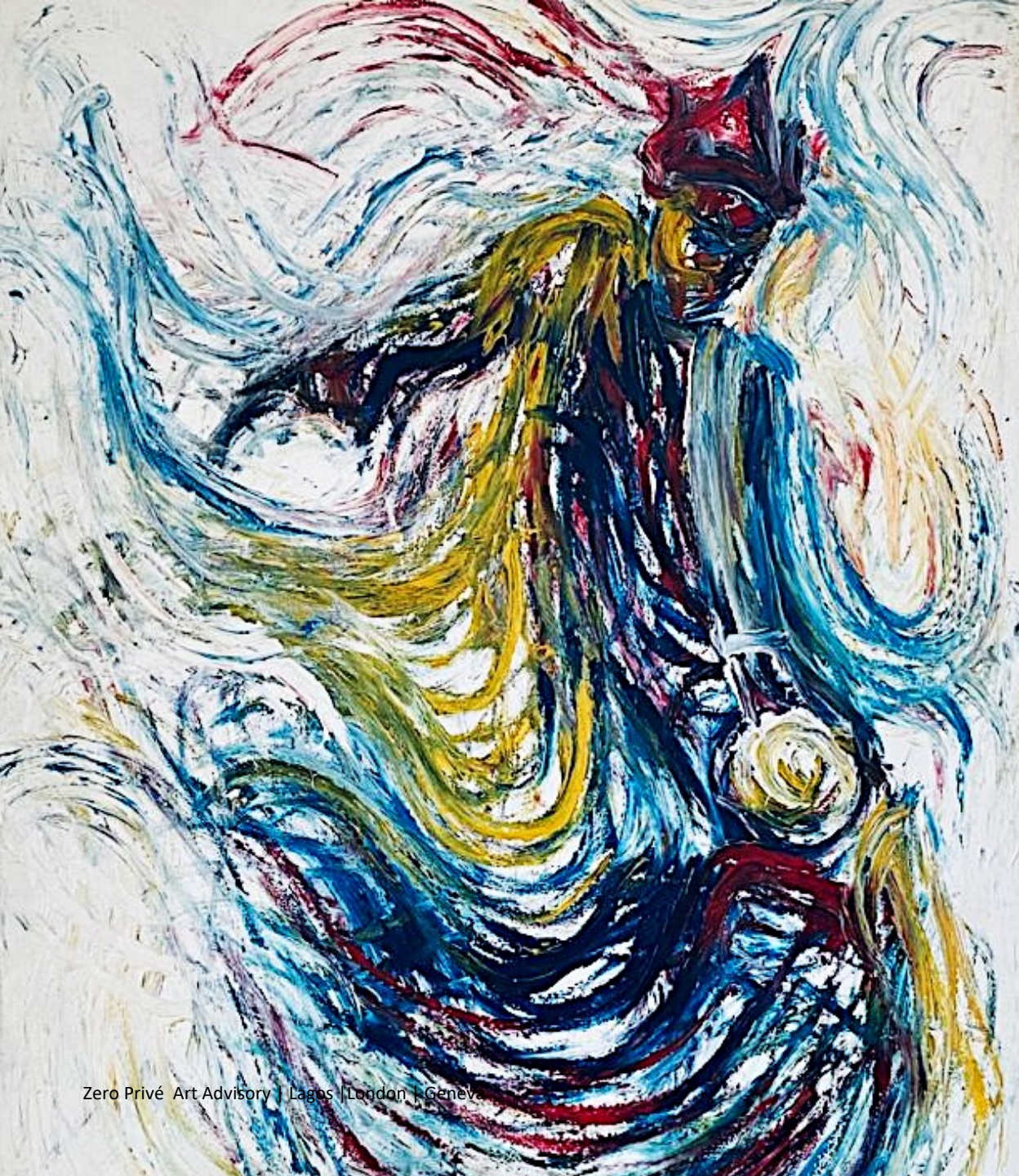
DRUMMER Acrylic on canvas 2019 3 X 4ft