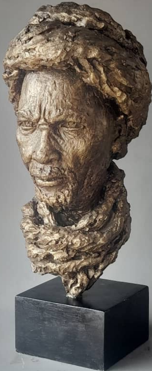
EXPLORER Bonded stone sculpture 2021 60cm