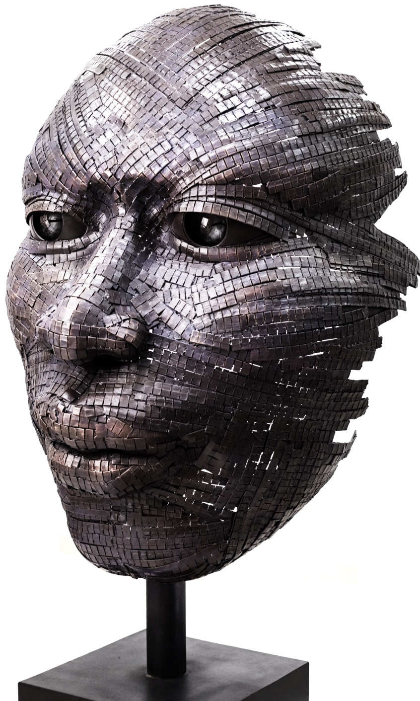
THE FACE Welded metal sculpture 2021 6ft